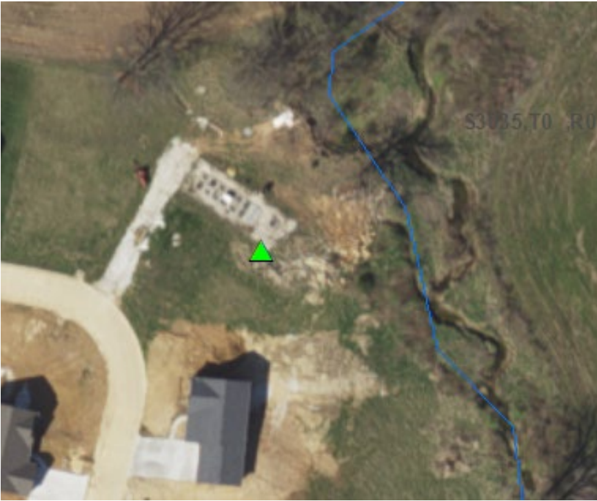
LOCATION OF FACILITY OUTFALL