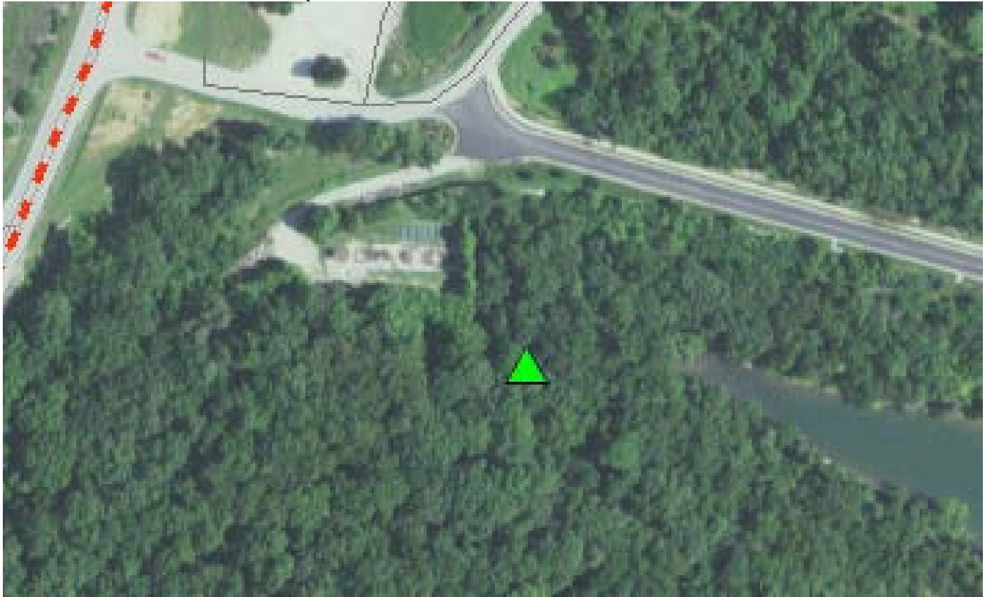
Aerial image from ArcReader of the wastewater treatment facility and the outfall (green triangle).