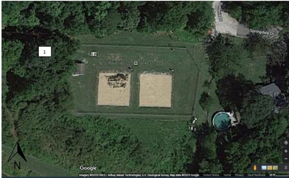
Aerial Map B: Layout of subject facility. 1 – Outfall #001