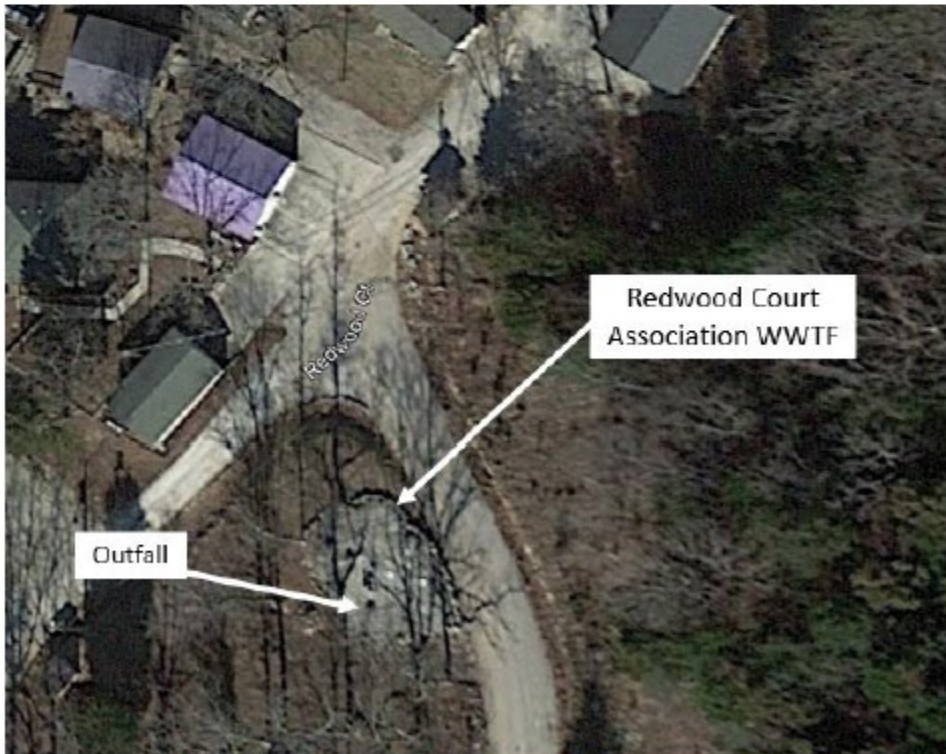
Figure 2. Close-up overhead view of the facility.