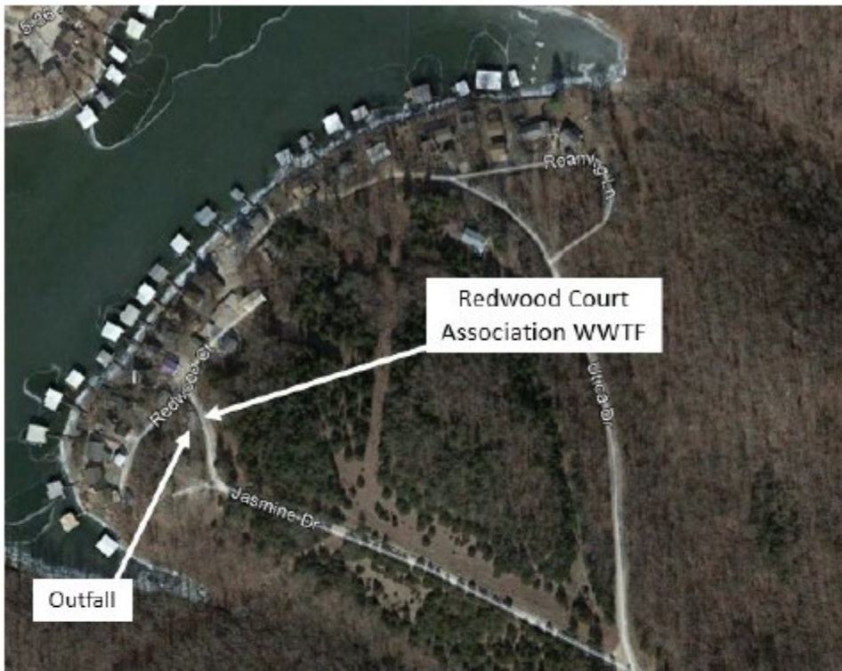
Figure 1. Overhead view of the facility.