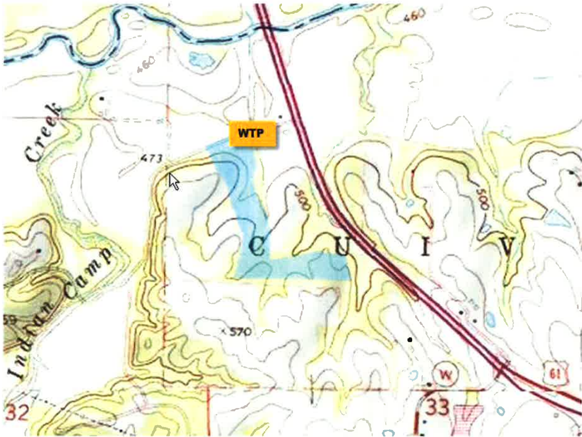
MO-0132373; Jaxson Estates WWTP – Topographic map