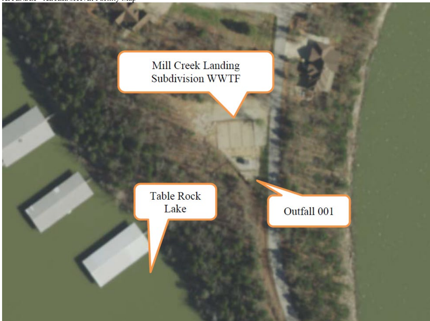
AERIAL IMAGE OF FACILITY FROM JUNE 27, 2018 INSPECTION REPORT