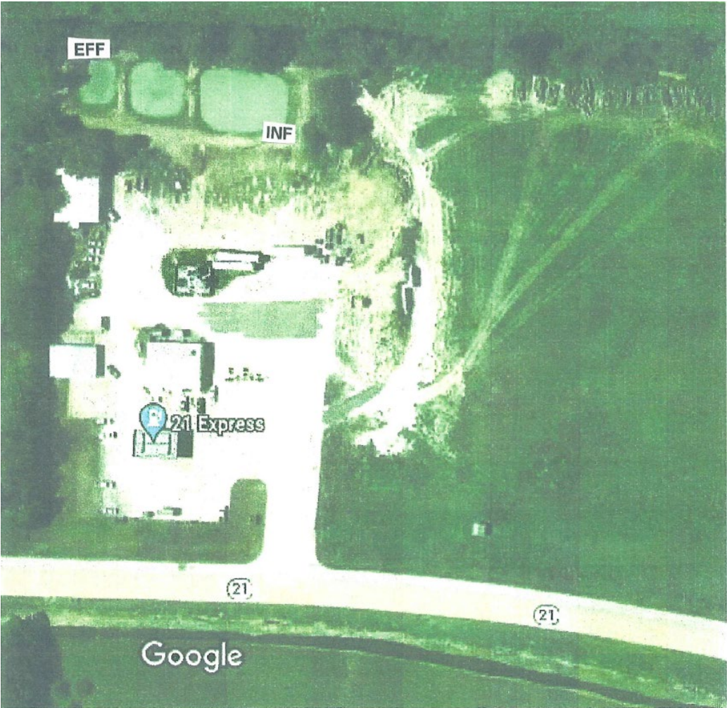
Imagery ©2021 Maxar Technologies, Map data