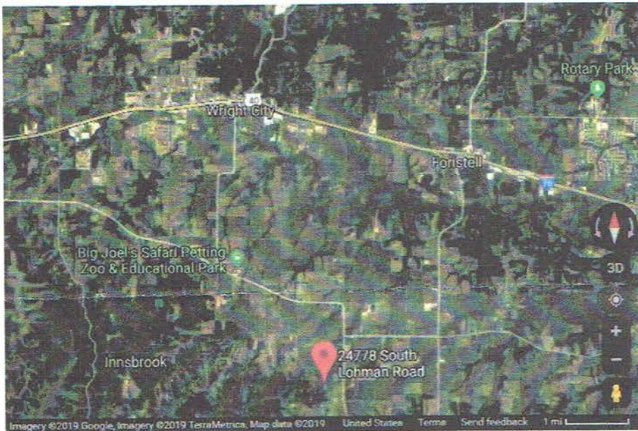
Figure 1: General location of Stewart MHP WWTF.