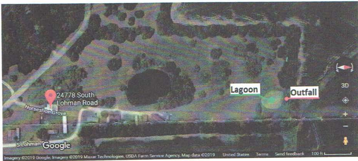
Figure 2: Aerial view of the facility.