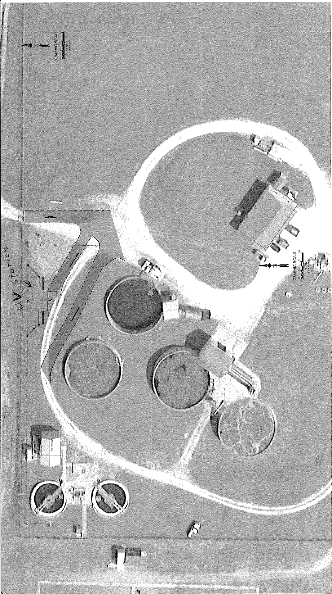
CITY OF BOWLING GREEN'S WASTEWATER TREATMENT FACILITY WITH NEW UV BUILDING SKETCHED IN PLACE JUNE, 2020