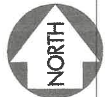
EXHIBIT 1 STOUTSVILLE RESORT LAGOONS

https://media.maps.arcgis.com/apps/webappviewer/index.html?id=1d81212e084478ca0dae87c33c8c0ce