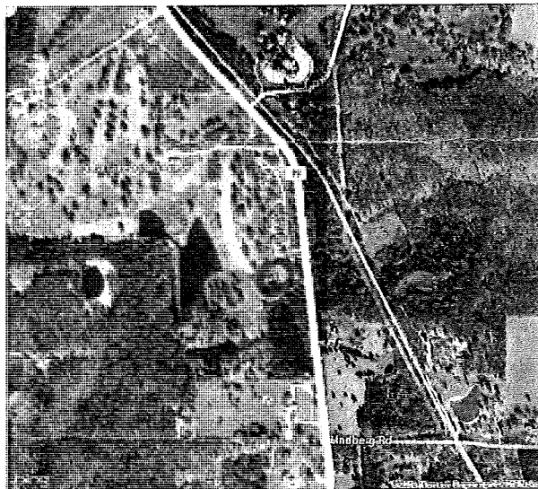
Village at Four Condos WWTF.

Village at Four Condos is located just south of Cuba on Hwy 19. The WWTF receives and treats domestic waste from Condos only. The WWTF is an extended aeration "package plant" with sludge storage, tertiary sock filtration, chlorine disinfection and de-chlorination. The true outfall of the WWTF is located across a portion of the adjacent golf course, approximately 1,000 feet west of the WWTF.