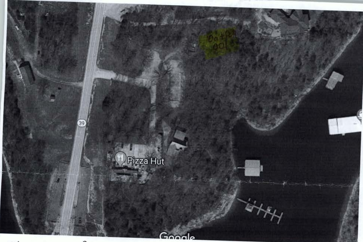
Shell Knob Pizza Hut MO-0102741