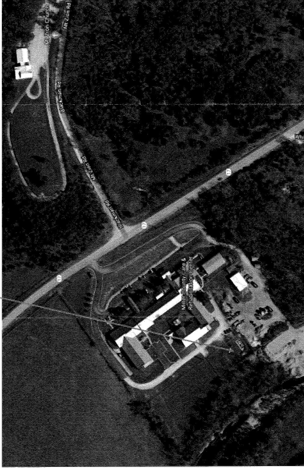
MO0086631 - Miller County Nursing Home