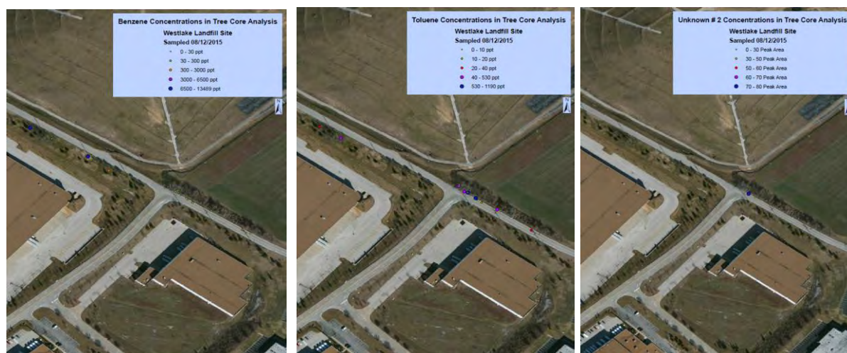
Figure 4 Mapped tree core concentrations for Benzene, Toluene, and 'Unknown 2' for trees samples in April 2015 at WLL. Also shown as Figure 12 of the WLL analytic report (Burken et al. 2015)

Resampling in August 2015 revealed BTEX and the Unknown 2 again in the area along Old St. Charles road affirming presence of these pollutants in the rooting zone of the vegetation along the roadway near the WLL property boundary and perimeter of South Quarry. Detected levels did change from the April 2015 sampling as is often observed (Limmer et al. 2014) and likely attributed to changes in the transpiration rates off the vegetation, changing in the soil water content, and altered degradation rates in the rhizosphere. These factors are all interrelated and have been shown to alter contaminant fate and transport rates.