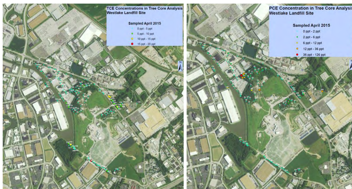
Figure 2 Mapped tree core concentrations for TCE and PCE for trees samples in April 2015 at WLL. Also shown as Figure 9 of the WLL analytic report (Burken et al. 2015).

Concentrations of cDCE were low and only detected on the WLL property in limited samples. Analytic sensitivity of cDCE is roughly two orders of magnitude lower than PCE and PCE as noted above. cDCE is a daughter product (metabolite) of reductive dechlorination processes that can degrade these ClVOCs in-situ .